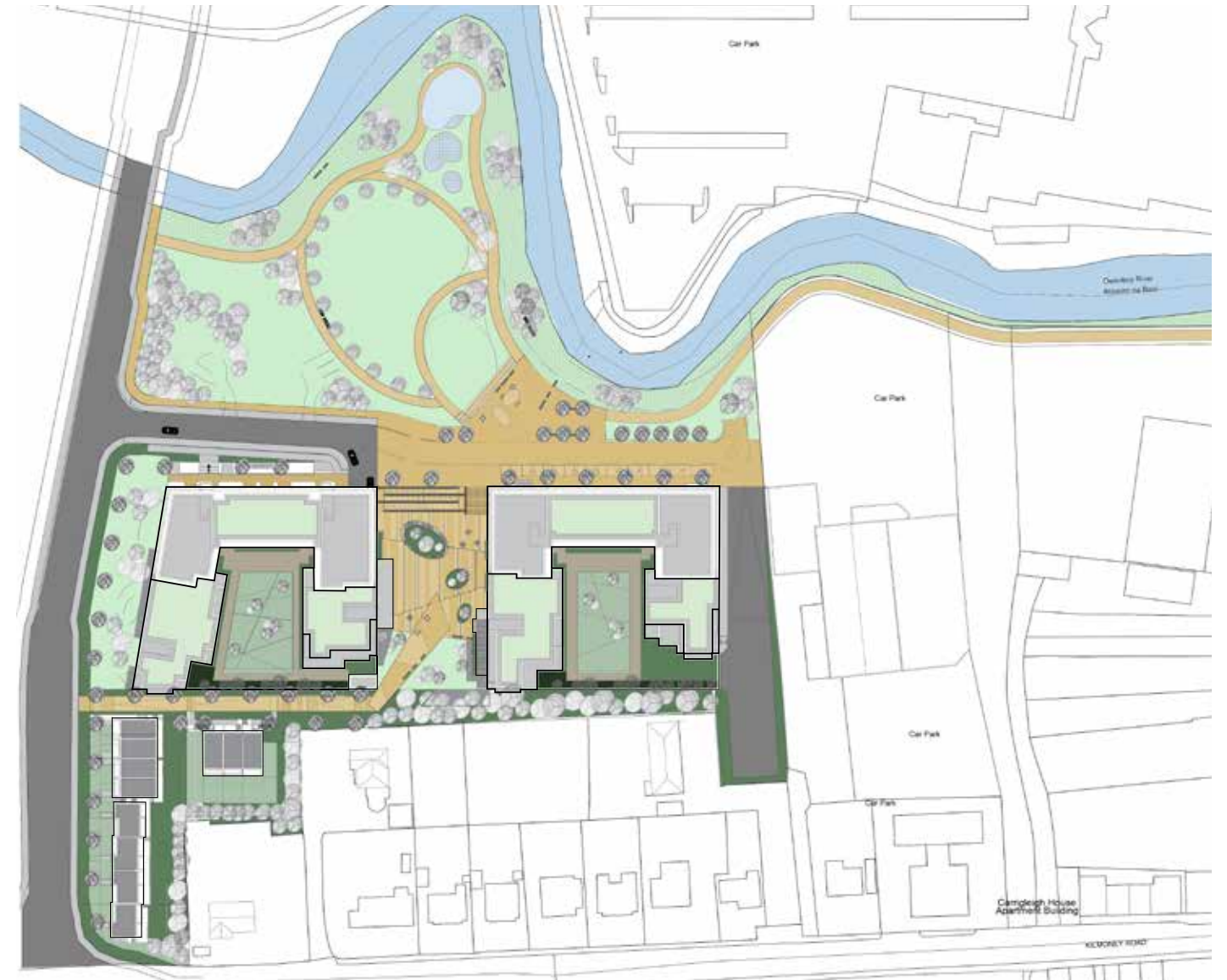
SITE PLAN WITH EXTENSIVE PEDESTRIAN AND CYCLE PATHS