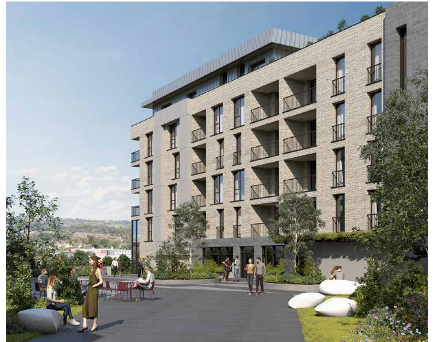
VIEW OF LANDSCAPED PODIUM