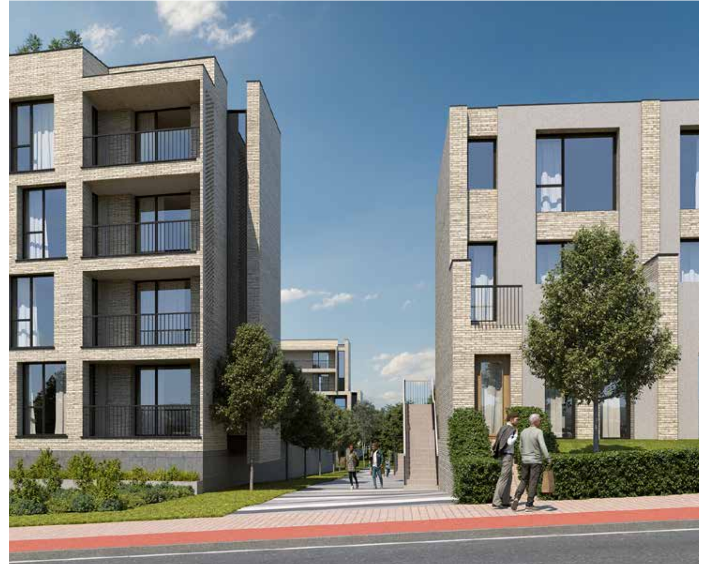
PEDESTRIAN WALKWAY BETWEEN TOWN HOUSES & APARTMENT