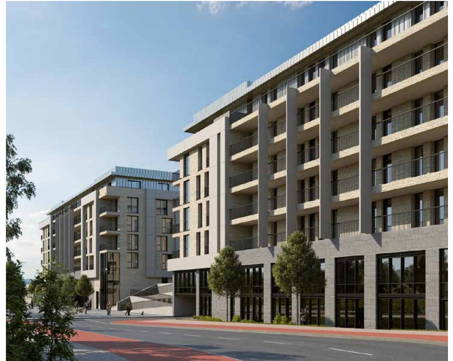
MAIN APPROACH WAY TO APARTMENT BUILDINGS AND RETAIL