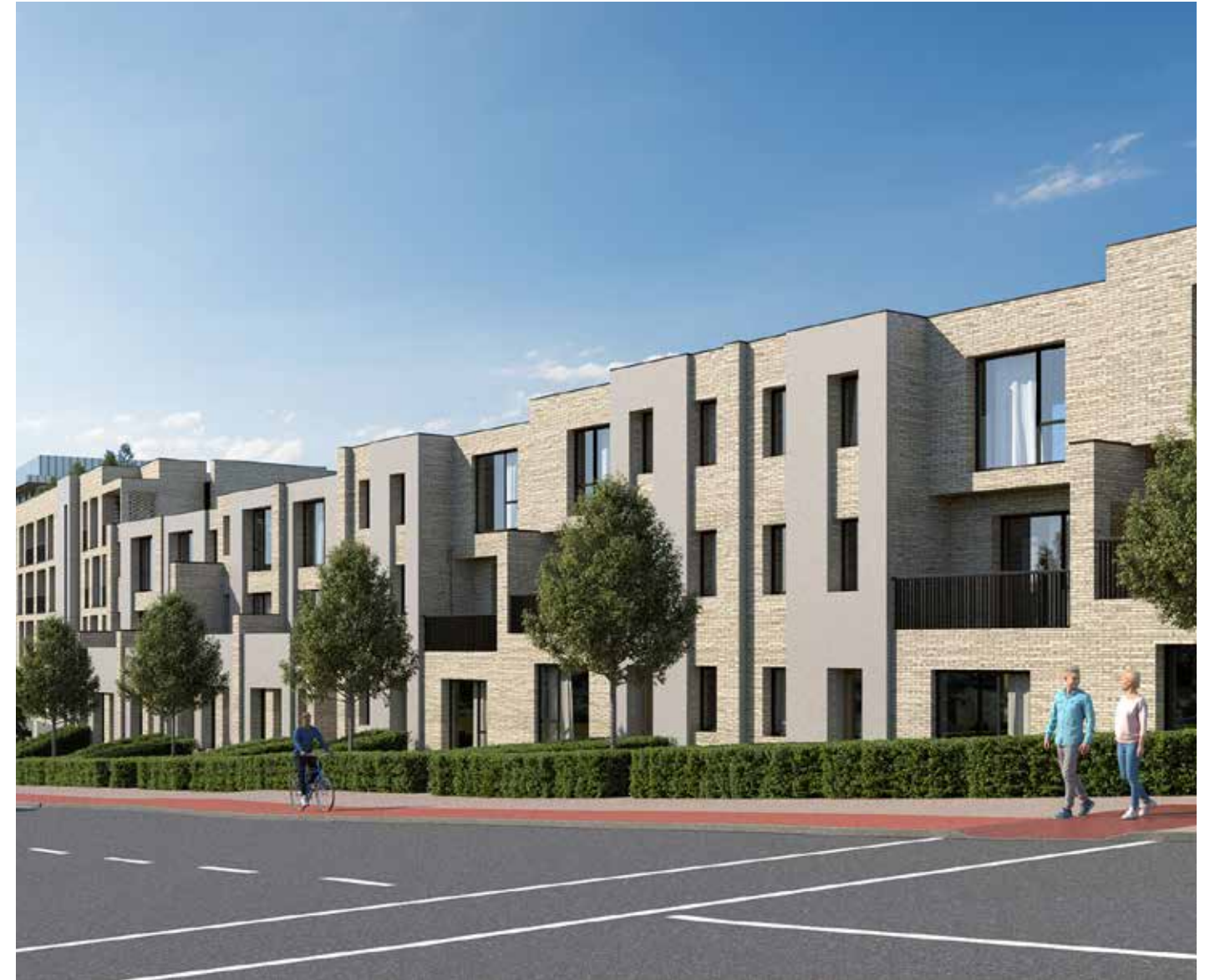
VIEW OF TOWN HOUSES ON INNER WESTERN RELIEF ROAD